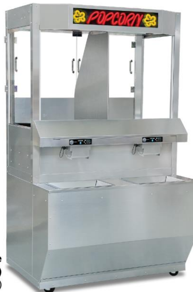
ReadyServe on a Base Model 2785 (052) (Base included)