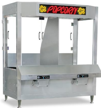
Countertop ReadyServe Model 2785 (002)