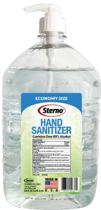
Sterno Hand Sanitizer – Refill sold separately