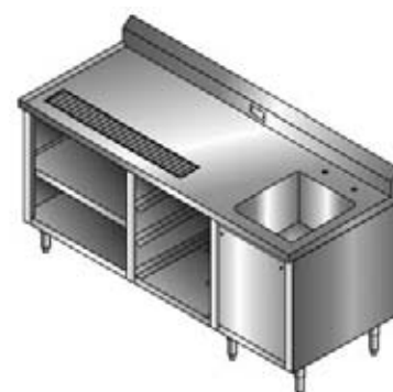
Beverage Counter with Rack Slides

*Specify R for bowl on right, L for bowl on left.