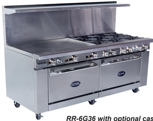
RR-6G36 with optional casters

Models: RR-12 RR-10G12 RR-8G24 RR-6G36 RR-4G48 RR-2G60 RR-G72 RR-10GT12 RR-8GT24 RR-6GT36 RR-4GT48 RR-2GT60 RR-GT72