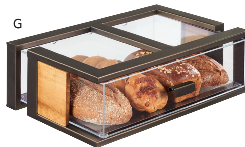
G. SIERRA PASTRY DRAWER ITEM 3928-84 | 22½Wx14½Dx7½H

Please visit www.calmil.com/legal for a complete list of California Proposition 65 related items.