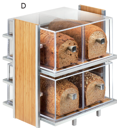
D. BAMBOO BREAD CASES ITEM 1279 | 14Wx11½Dx15H - Bamboo ITEM 1480 | Replacement Bin w/ 2 Drawers ITEM C1480DRAWER | Replacement Drawer