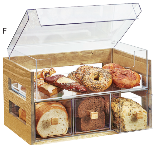
F. MADERA BREAD DISPLAY ITEM 3624-99 | 20¼Wx12¾Dx13¾H