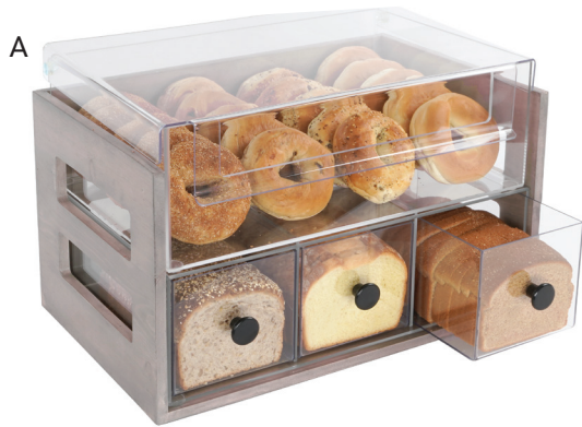
A. ASPEN BREAD DISPLAY ITEM 3624-110 | 20¼Wx12¾Dx13¾H