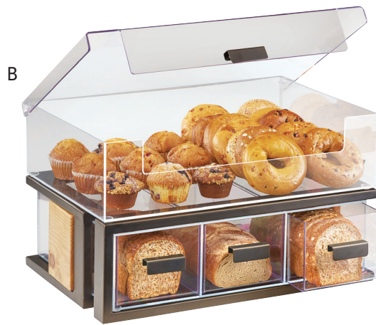
B. SIERRA BREAD DISPLAY ITEM 3908-84 | 22½Wx14¾Dx13¾H