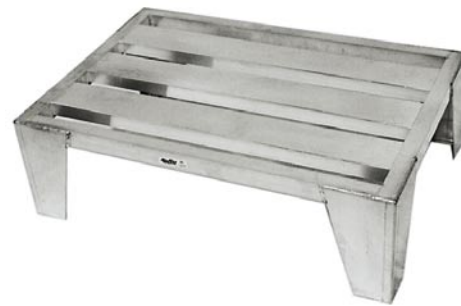
Gusset Leg(DRCGL) Option