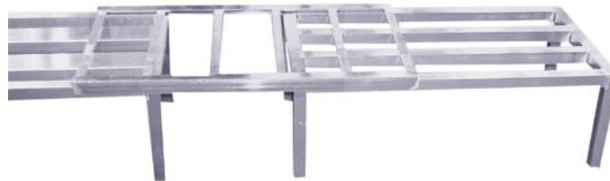
Spanner Rack for Dunnage Racks

Customize your space to maximize your space add a spanner