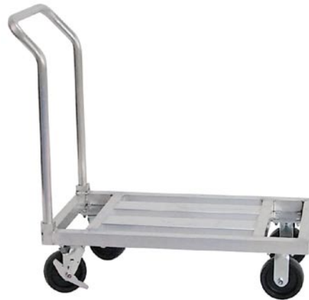
DRC2436MHD/HD24 Mobile Unit w/Optional Handle