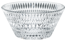
6 \frac{3}{8} " Bowl, 25 \frac{1}{2} oz. Item No. N104985 25 \frac{1}{2} oz. L6 \frac{3}{8} " H3" 6 pcs SCC B297035