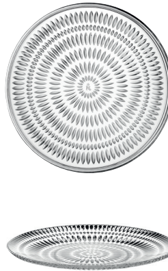
9" Plate Item No. N106160 L9" H \frac{3}{4} " 8 pcs SCC B302234