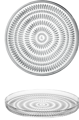
8 \frac{5}{8} " Stacking Plate Item No. N105817 L8 \frac{5}{8} " H \frac{3}{4} " 6 pcs SCC B300698