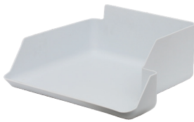
S-SLAWTRAY Slaw Tray