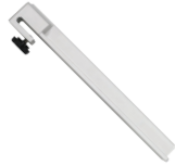
S-FENCE High food fence (12.125" x 1.125")