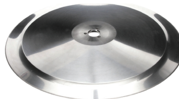
STAINLESS STEEL BLADE