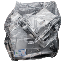
SC-LARGE Slicer Sanitation Cover