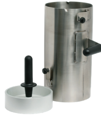
S-VEGHOP Vegetable Hopper