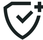
S-XDSL M Extended Warranty