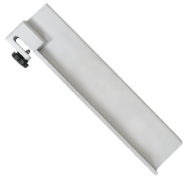
S-FENCEHI High food fence (12.125" x 3")