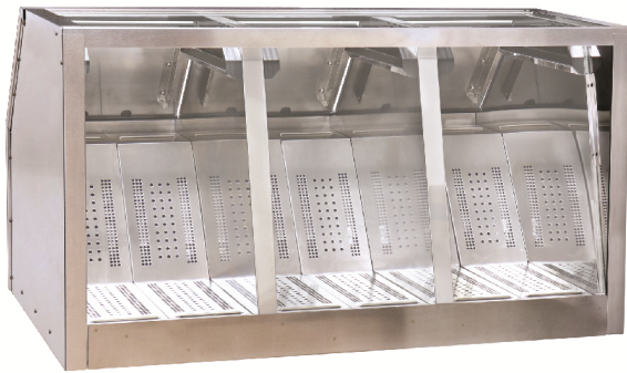
Customer Side (020 Series shown for general image reference only.)