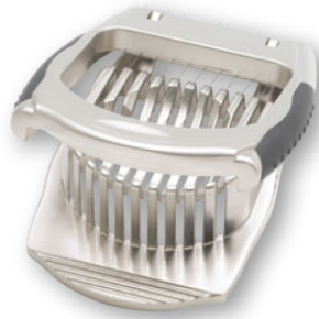
48021 • Deluxe Egg Slicer SS Wires, 3 1/2" x 4 1/2" (bx)