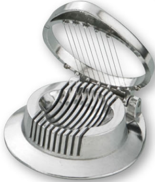
15504 • Classic Mushroom and Egg Slicer AL, SS Wires, 4 1/4" x 4 1/4" x 1 1/4" (bx)