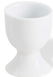
79/326 • Single Egg Cup Porcelain, 2 1/2"