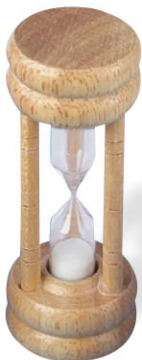
16 • 3-Minute Egg Timer WD/Glass 4" x 1 1/2" (bx)