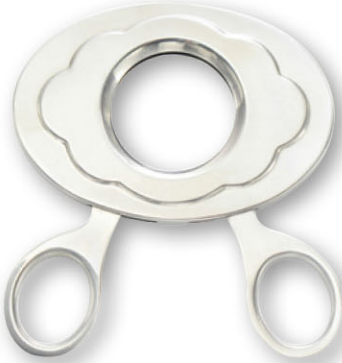
93242 • Egg Topper SS, 4" x 3 1/2" (cd)