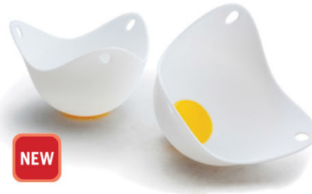
57000 • PoachPod Yolk Silicone, 3" (set/2)