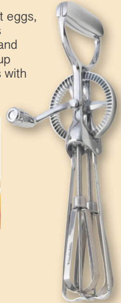
45753 • Deluxe Egg Beater SS Blades, 12"