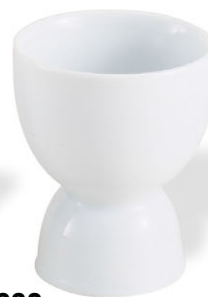
400220 • Double Egg Cup Porcelain, 2 1/2" x 3 1/4"