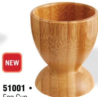
51001 • Egg Cup Bamboo, 2 1/4" x 2 1/2" (set/4)