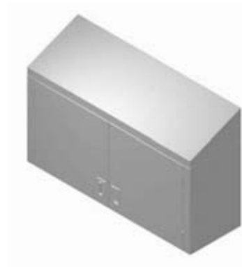
Wall Cabinet with Hinged Doors