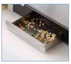
Old maid drawer catches unpopped kernels