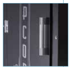
Textured storage door handle