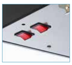
Simple two-switch operation