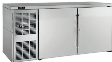
BBSLP60 with stainless steel door shown