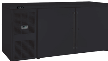
BBSLP60 with stainless steel door and optional all black