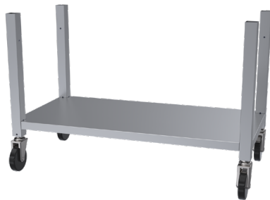
SCG-48SSC stand with casters