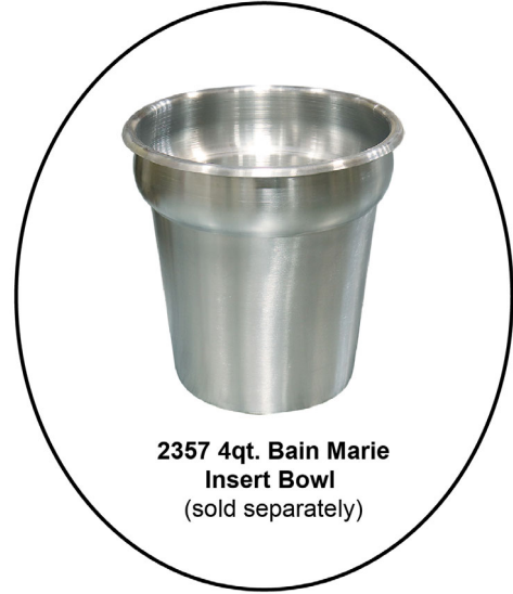
2357 4qt. Bain Marie Insert Bowl (sold separately)