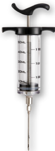
43808 • Flavor Injector Nylon/PC/18/8 SS, 1.5 oz. capacity (cd)