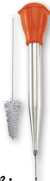
5902 • Baster w/ Cleaning Brush and Injector Needle SS, 13", 2 oz. (cd)