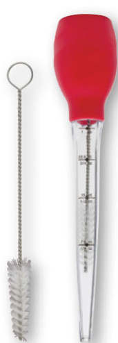
43730 • Baster PL/Silicone, 11 3/4", 1 oz. Includes cleaning brush (cd)