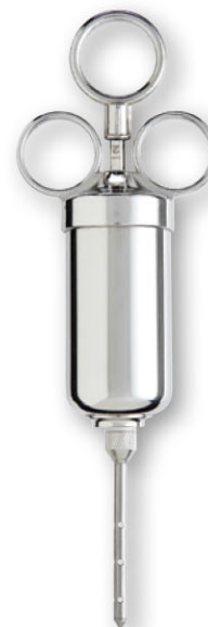
22005 • Marinade Injector Nickel-Plated Copper/SS Needles, 2 oz. capacity (cd)