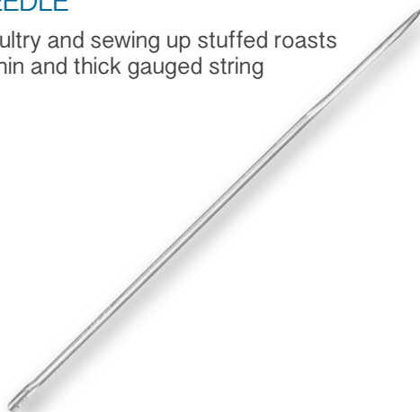
2417 • Straight Trussing Needle, SS 8"