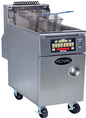
RHEF-75-CM, Shown with optional casters

Models: RHEF-75-DM RHEF-75-DM2 RHEF-75-CM