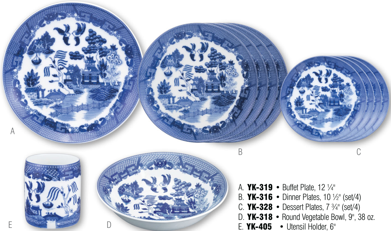
A. YK-319 • Buffet Plate, 12 ¼" B. YK-316 • Dinner Plates, 10 ½" (set/4) C. YK-328 • Dessert Plates, 7 ¾" (set/4) D. YK-318 • Round Vegetable Bowl, 9", 38 oz. E. YK-405 • Utensil Holder, 6"

Originating in England, circa 1780, the Blue Willow design depicts the famous Chinese legend of a wealthy man whose daughter falls in love with his clerk. The young couple elopes and the father pursues them through his garden and onto the bridge where they transform into lovebirds and fly off beyond his reach. Central components to the story, the weeping willow, pagoda, bridge and lovebirds, are shown on every piece. Blue Willow is one of the most popular and collected dinnerware designs in the world today.