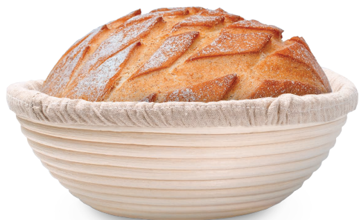
22063 • Round Bread-Proofing Basket w/Liner Palm Wood Rattan/Cotton/Linen, 9 ¼" x 3 ¼"