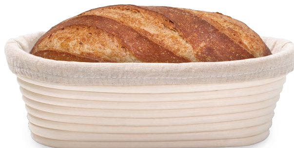
22064 • Oval Bread-Proofing Basket w/Liner Palm Wood Rattan/Cotton/Linen, 9 ½" x 6" x 3 ¼"