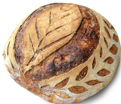
43881 • Artisan Bread Lame 18/8 SS/Romanian Beechwood, 7 ¼" x 1" (cd)