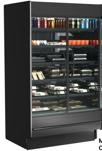
MD485DR Shown With Optional French Doors