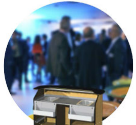
#68500 L in maple laminate