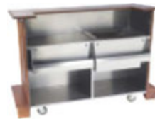
Standard stainless steel interior shown above.