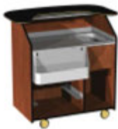
#68400 L in red maple laminate