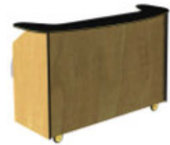
#68500 front view