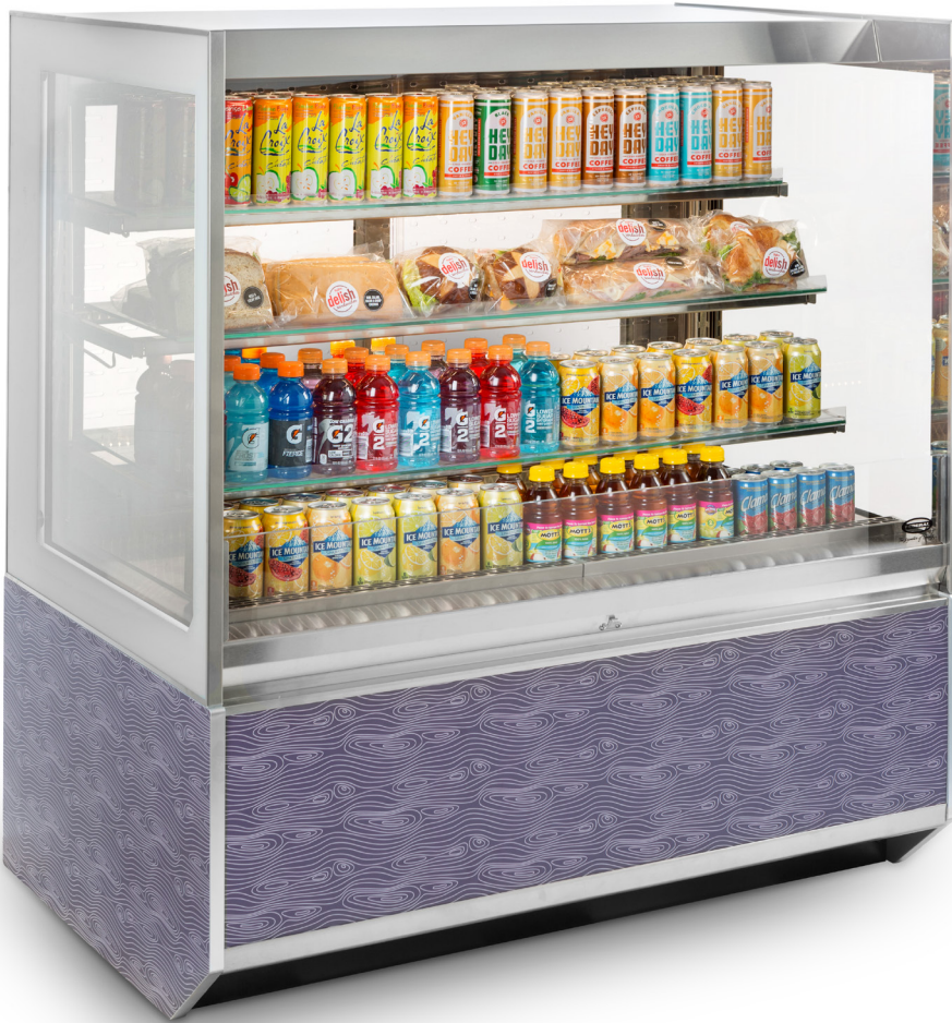
Model ITRSS4834-B18 Shown with optional laminate

Designed for customers looking for a rich, up-scale Italian styling for maximum visual appeal that will drive product sales.