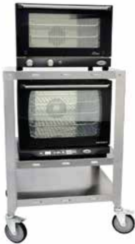
OV-HDS with 2 OV Convection Ovens