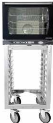
OST-34A-C with 1 XAF Convection Oven