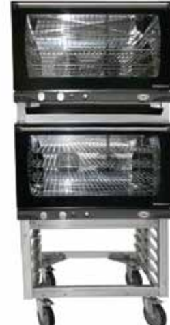
OST-195-CS with 2 XAF Convection Ovens & Stacking Kit