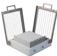
Double Arm Model