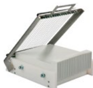
Single Arm Model