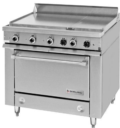
Model 36ER32 All Purpose Top Range With 2 Sections, 3 heat zones