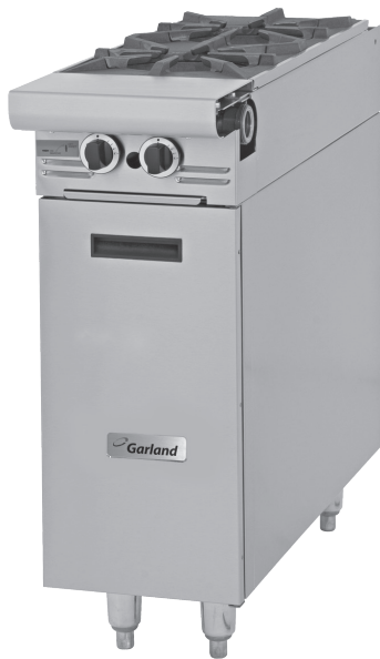
Model M12S 12" Range Attachment With 2 Open Burners