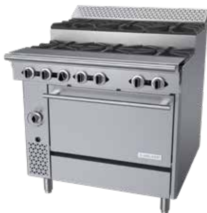
Model C36-6SUR Step-Up Range with 6 12" Open Burners