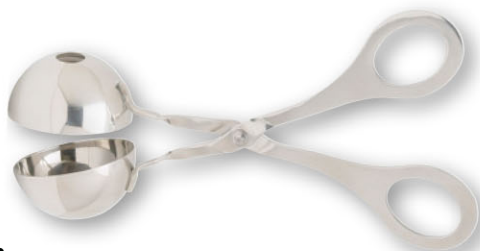
43699 • Meat Baller 18/8 SS, 6 3/4"