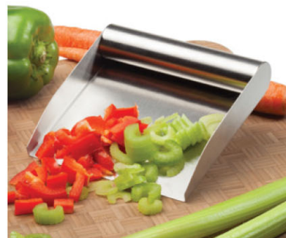
43751 • Food Scoop 18/8 SS, 6" x 6" (cd)