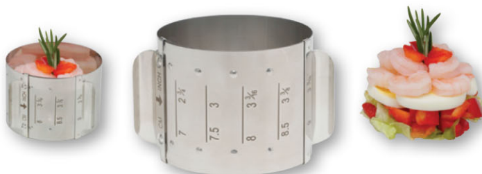
93235 • Adjustable Food Ring, 18/8 SS Ring adjusts to five different sizes: 2 3/4", 3", 3 3/16", 3 3/8", 3 9/16" (bx)