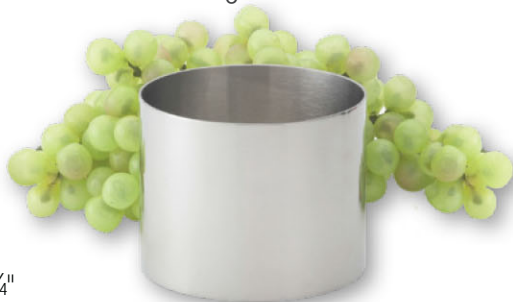
93211 • Food Ring 18/8 SS, 2 3/4"