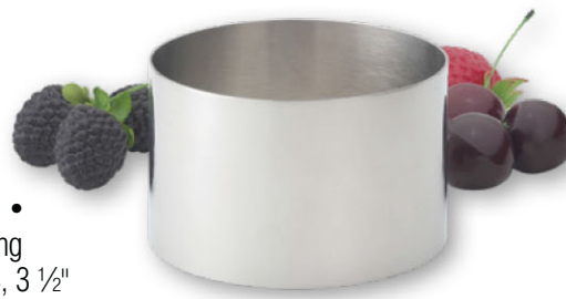
93212 • Food Ring 18/8 SS, 3 1/2"