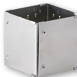
93256 • Adjustable Square Food Ring, 18/8 SS Ring adjusts to 4 different sizes: 2 3/8", 2 3/4", 3 3/16", 3 9/16" (bx)