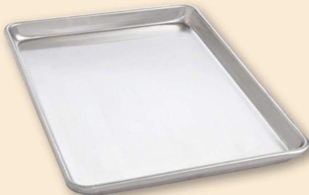
31813 • U.S. Half Size Baking Pan AL, 13" x 18"