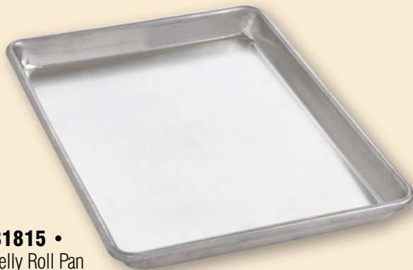
31815 • Jelly Roll Pan AL, 10 1/4" x 15 1/4"