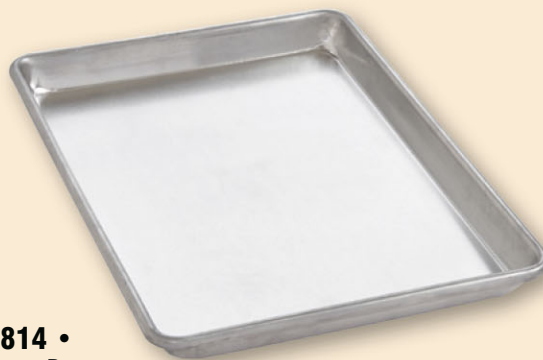
31814 • Quarter Pan AL, 9 1/2" x 13"