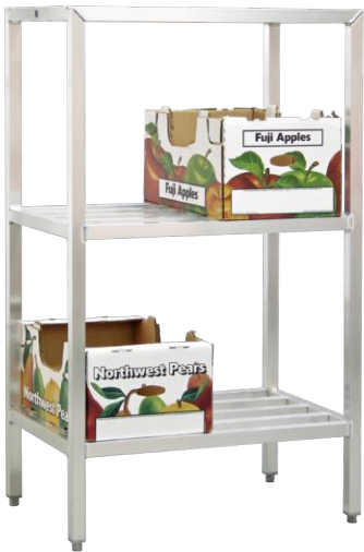
H.D. Series Three Shelf Unit