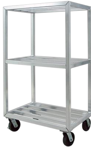
H.D. Series Three Shelf Unit w/ Optional "M6" Casters Casters are factory installed only.