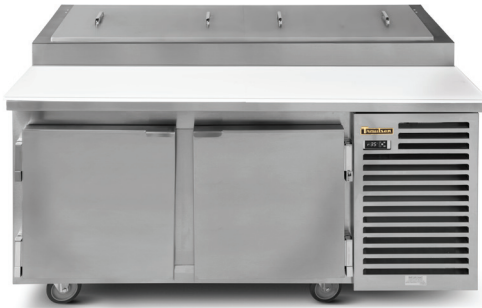
71" WIDE MODEL TB071SL2S - 2 ROW TB071SL3S - 3 ROW