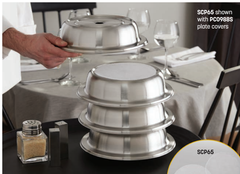
SCP65 shown with PC0988S plate covers