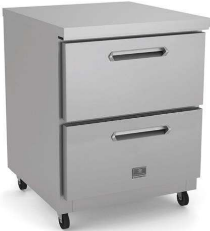
738337 (KCHUC272DR-32) 2-Drawer Under Counter Refrigerator 27" Long 32" Tall