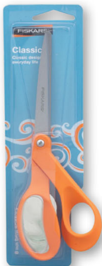
9451 • Fiskars™ Right-Hand Shears 8 1/4" (cd)