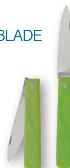
2901GRN • Folding Paring Knife, Serrated Blade, Lime Green Carbon Steel/WD, 3 1/4" Blade