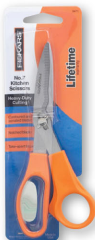
9471 • Fiskars™ Kitchen Scissors SS Blades, 7 1/2" (cd)