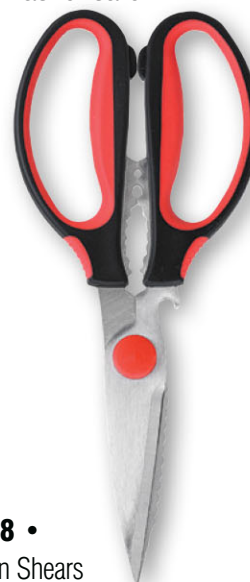
38008 • Kitchen Shears SS/PL, 8 3/4" (cd)