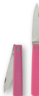
2901PNK • Folding Paring Knife, Serrated Blade, Rose Pink Carbon Steel/WD, 3 1/4" Blade