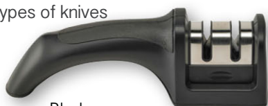
38010 • Dual-Action Knife Sharpener, Black Base: PL/RB, Cartridge: SS w/Carbide and Ceramic Inserts, 7 1/2" x 2"