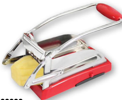
20000 • French Fry Cutter 18/8 SS/PL, 10 1/2" x 4" x 5" (bx)