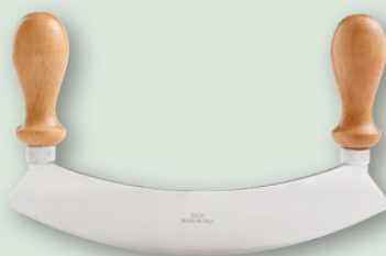
14812 • Mamma Maria's Mezzaluna Rocking Chopper SS/WD, 9 1/2" x 5" (cd)