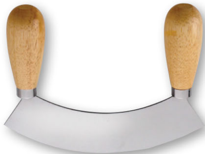
42148 • Mezzaluna Chopper, WD/SS, 6 3/4" (cd)