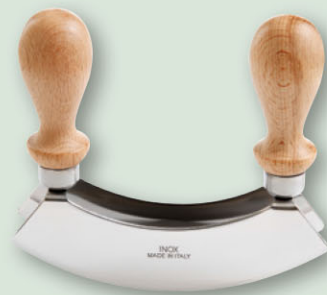
14813 • Aunt Marisa's Double Mezzaluna Rocking Chopper, SS/WD, 5 1/2" x 4 1/2" (cd)