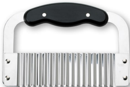
43130 • Wave Slicer SS Blade, 7 1/4" x 5"