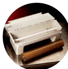
Dowel rod standard

Product support or video training visit: www.kenkut.com