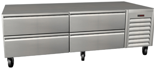
Model 20072SB with optional casters