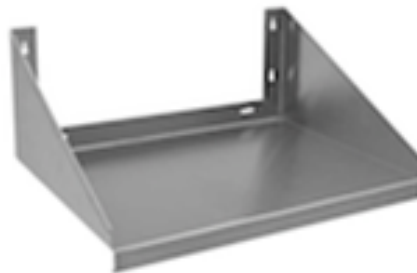
MICROWAVE WALL SHELVING