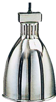
1 LX One hanging light. Heated Area: 12"x12" Length: 6 1/2" Height: 10"

Over 100 styles of Keating Keep Krisps® are available in hanging, wall mounted, adjustable and portable units.