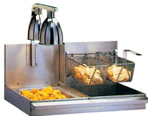
2 LCF Two lights, splashback mounted over preparation area Heated Area: 12"x20" Length: 19" Height: 23"-28"