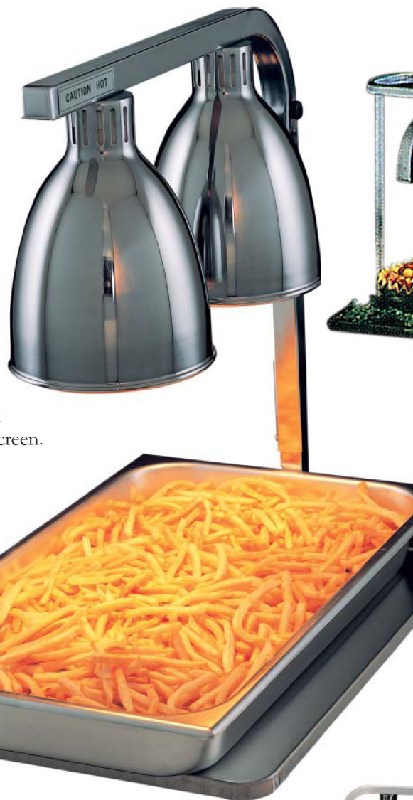
2 LOR Two lights, open ended bracket with pan and screen. Heated Area: 12"x20" Length: 22 1/2" Height: 14"