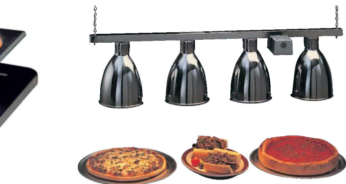
4 LB Four lights. Heated Area: 12"x37" Length: 36" Height: 9 1/2"