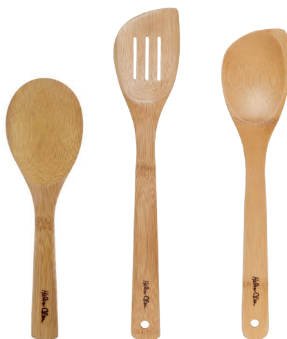
97062 9" rice paddle 97057 13" slotted spatula 97054 12" corner spoon

97145 • 3-Piece Stir Fry Set Bamboo (net bag)