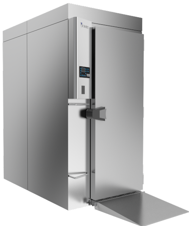
Note: Shown With Optional Ramps