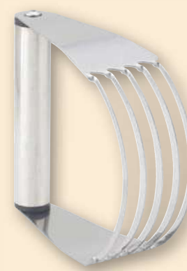
45752 • Pastry Blender SS, 4 1/2" x 4 1/4" x 1 1/2" (cd)