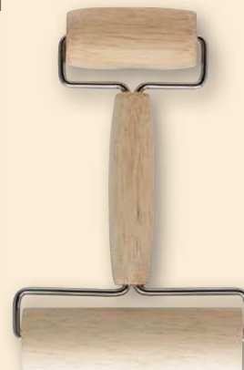
43679 • Double Dough Roller WD, 7 x 4 1/2" (cd)