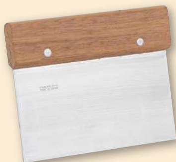
182 • Dough Scraper SS/WD, 6" x 4 3/4"