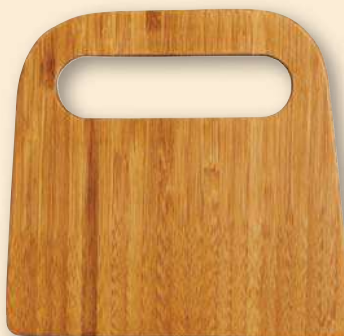
51002 • Bench/Dough Scraper Bamboo, 6" x 5 1/2" (cd)