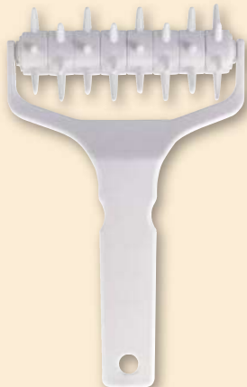
43843 • Dough Docker PL, 5" x 8" (cd)