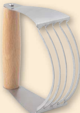
9213 • Pastry Blender WD/SS, 4 1/2" x 4 1/2" x 2 1/8" (cd)