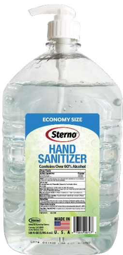
Sterno Hand Sanitizer Sold Separately