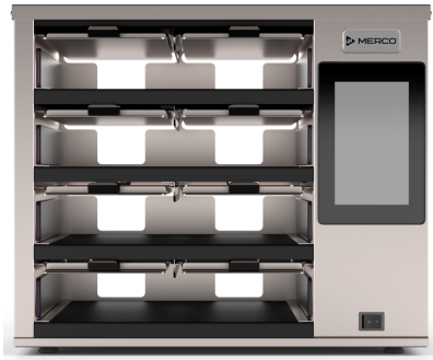
MHG42SST1T (Single Side)

Adding an "X" in front of the model number designates it as an export model.