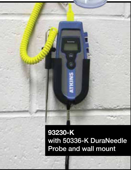
93230-K with 50336-K DuraNeedle Probe and wall mount

▶ SEE PAGE 56 FOR INSTRUCTIONS ON HOW TO MAKE A PROPER ICE BATH