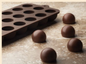
43763 • Truffle Chocolate Mold Silicone, 8 1/2" x 4" (bx)