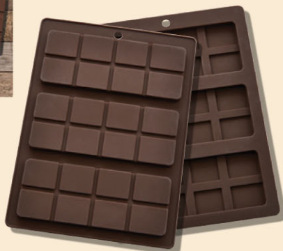
43829 • Chocolate Bar Mold Silicone, 8 1/2" x 6 1/4" x 1/4"