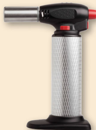
43750 • Cooking Torch AL/PL, 6 3/4" (cd)