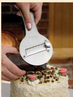
42189 • Chocolate Shaver 18/8 SS, 7 1/4" x 3 5/8" (cd)