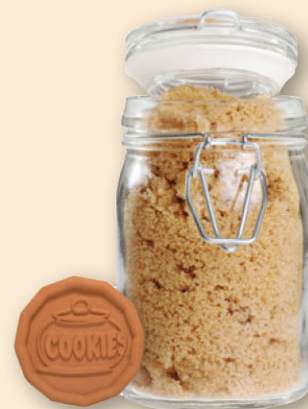
10153 • Brown Sugar Cookie Disk Terracotta, 2 1/4" x 5/8" (cd)