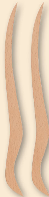
43771 • Ebelskiver Turning Tools Beechwood, 12" (set/2)