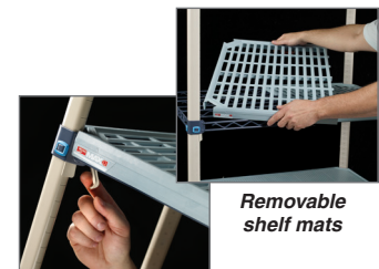
Removable shelf mats