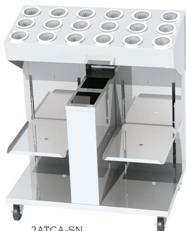
2ATCA-SN Shown with optional silverware cylinders