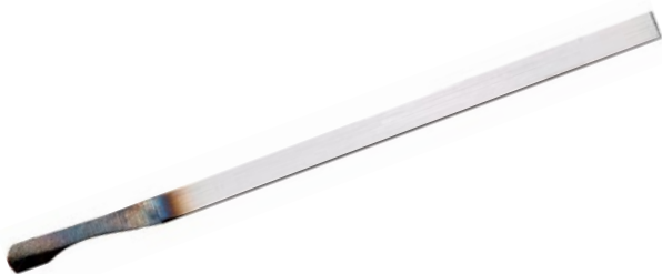
CARBON STEEL BAKER'S BLADE/BREAD LAME Pack of 12.