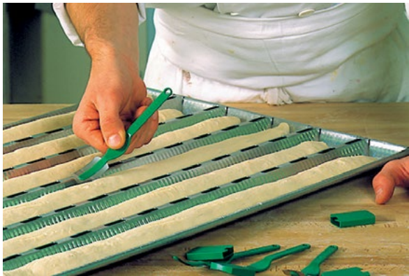
DOUBLE EDGED BAKER'S BLADE Stainless steel with a hygienic, ergonomic plastic handle that helps score baguettes for better dough rising.