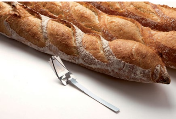
LAM'PLUS BAKER'S BLADE/BREAD LAME SET W/ REPLA-CEABLE BLADE Professional bread lame for scoring artisan loaves, baguettes, and more. Replaceable blades, versatile design by master baker Jean-Christian Horel. Secure cover.